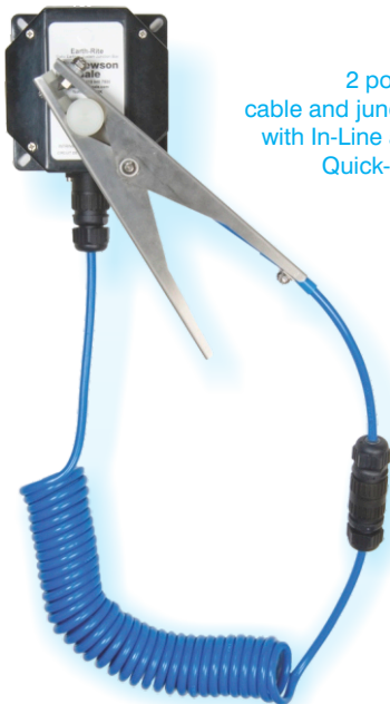
2 pole clamp, cable and junction box complete with In-Line and Junction Box Quick-Connectors