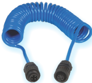
Hytrel cable supplied with male and female In-Line Quick-Connects