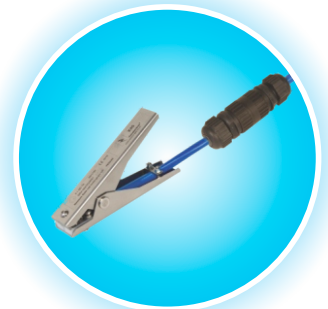
X45-IP with In-line Quick-Connect