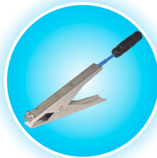
X90-IP with In-line Quick-Connect