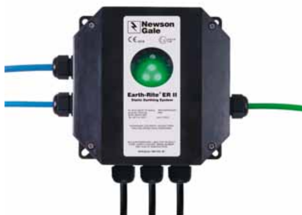
Figure 3. The Earth-Rite MGV truck mounted static grounding system

The MGV system has a user friendly operator interface which indicates when transfer operations are safe to begin. The grounding system is con-