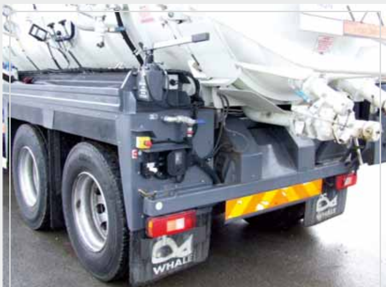
Figure 1. Static grounding system installed on vacuum truck used to recover flammable waste from storage tanks

source of energy which is immediately seeking to discharge itself in order to return the object to a natural state of electrical equilibrium. If the energy is allowed to discharge in an uncontrolled manner it will do so, in the majority of cases, in the form of an incendive electrostatic spark. Should such an event occur in the presence of a vapor or dust, when they are within their respective ignitable flammable and combustible thresholds, there is a high probability that ignition of the material will occur.